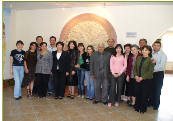
Armenian collaborators of RFL's ministry in the city of Gyumri

We eagerly wish to broadcast the programmes of Reformed Faith and life. We do count on your collaboration