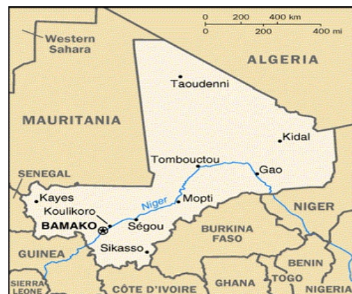
Radio Hope Africa is on the air on 97.8 MHz in the city of Kayes (Western Mali)

We have been greatly encouraged to see that our website ( www.foi-vie.org.za ) is regularly visited by an increasing number of people living in various – and sometimes unexpected – countries. An analysis made over the last two months shows visitors from France, Belgium, Ivory Coast, Spain, United Kingdom, Mauritius, Czech Republic, Armenia, Madagascar, Senegal, Colombia, Equator, United Arab Emirates, Switzerland, Italy, Norway, Australia, and – last but not least – South Africa, USA and Canada. Through this website also, and through all the texts we place on it, Christ is coming close to people.